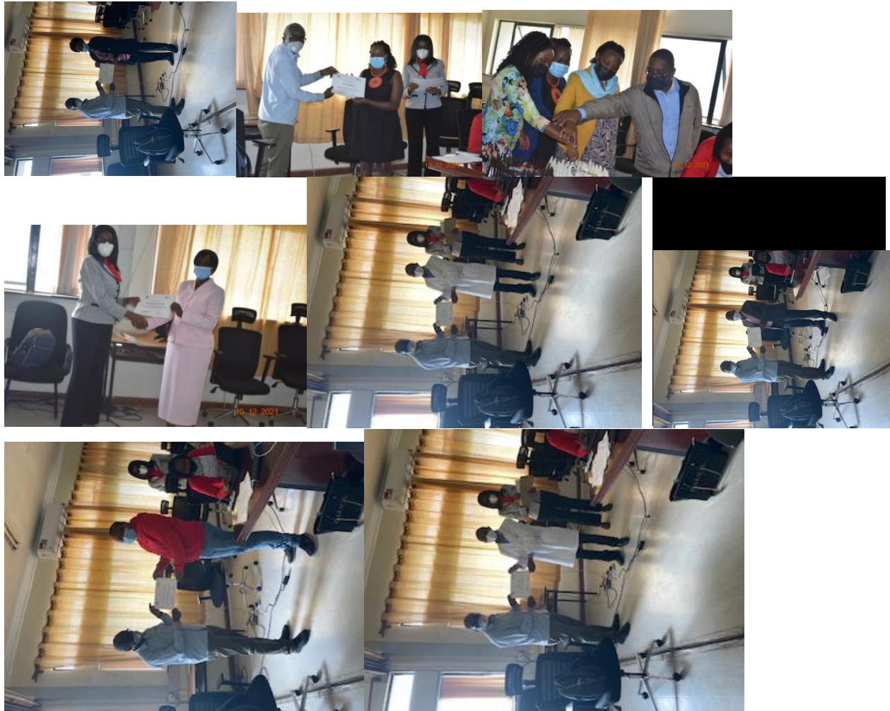
Cerificates award ceremony: 10 th December 2021

On completing the program, all trainees were awarded certificates of accomplishment.